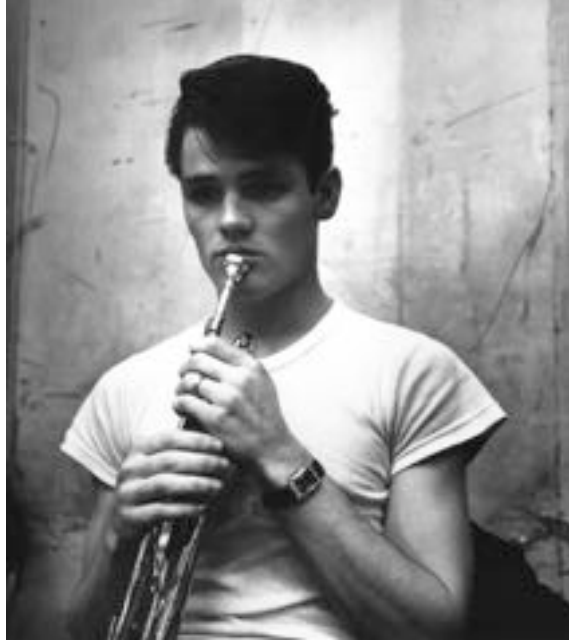
Chet Baker (12/23/1929 - 05/13/1988)