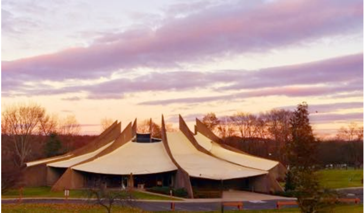
December 2017